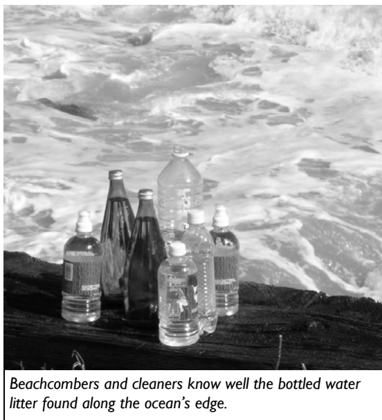
Beachcombers and cleaners know well the bottled water litter found along the ocean's edge.